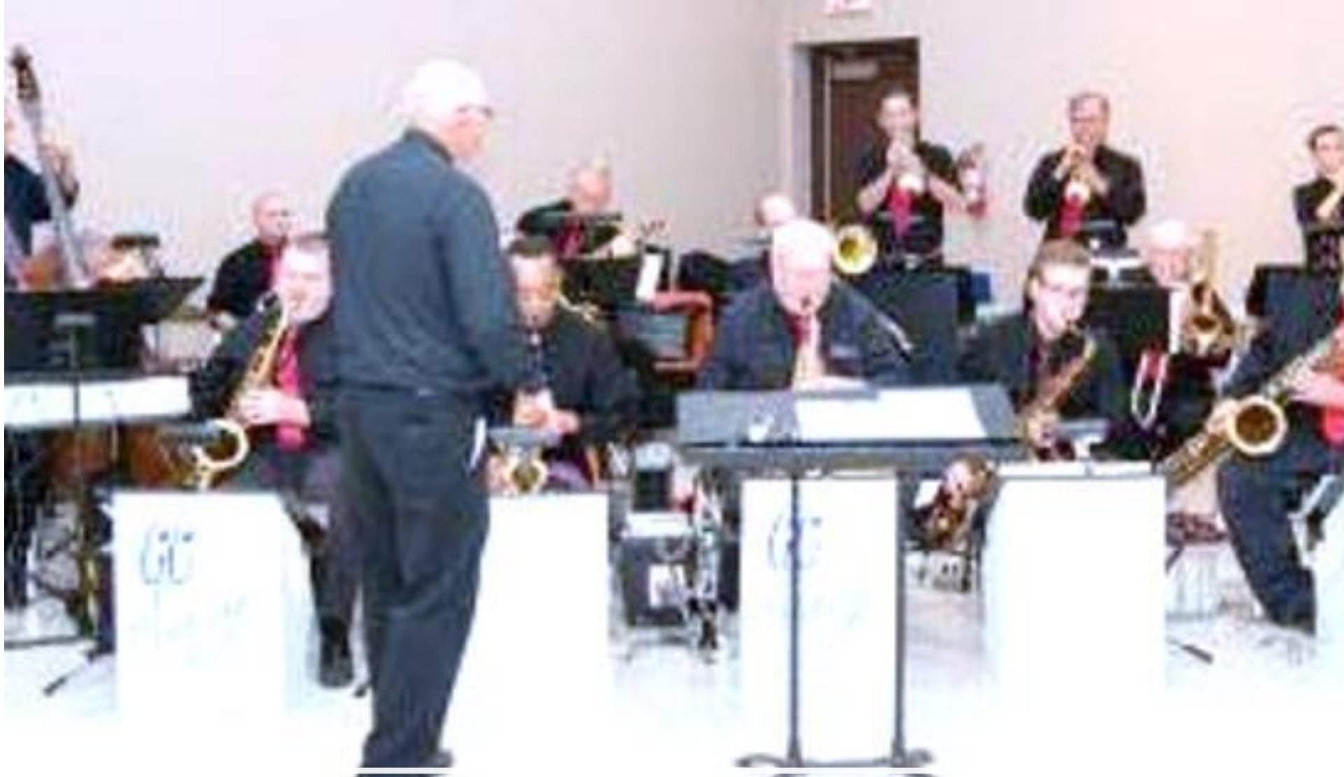
G.C. Swing Band Dinner and Silent Auction