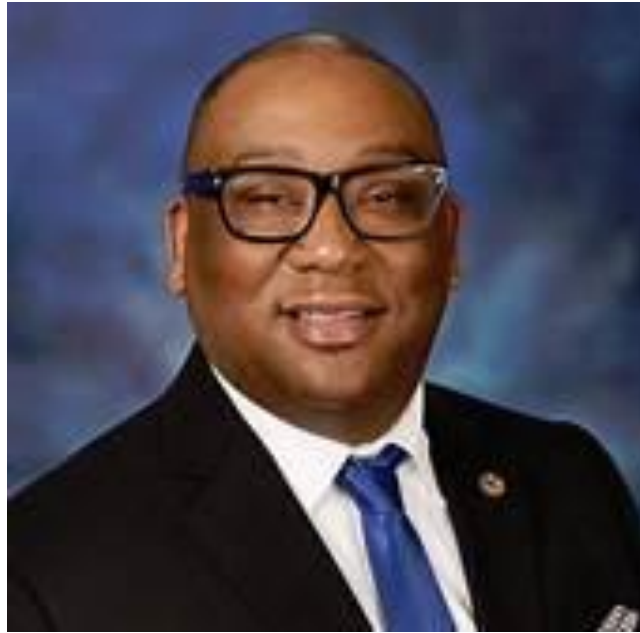
Senator Christopher Belt, 57 th District